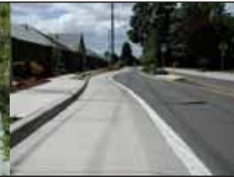
Olympia Washington Raised Bike Lane