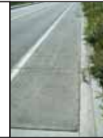
Eugene Oregon Permeable Bike Lane