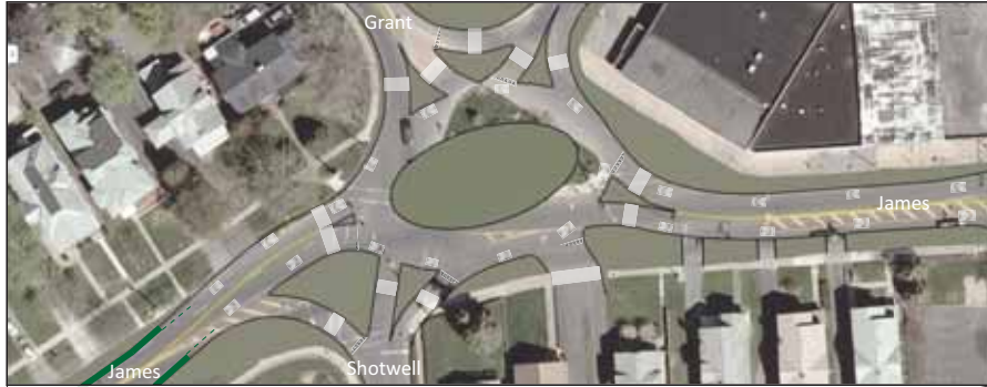
Roundabout Proposal at the Intersection of James Street and Grant Boulevard